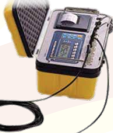
RW-2601P PROCESSING UNIT