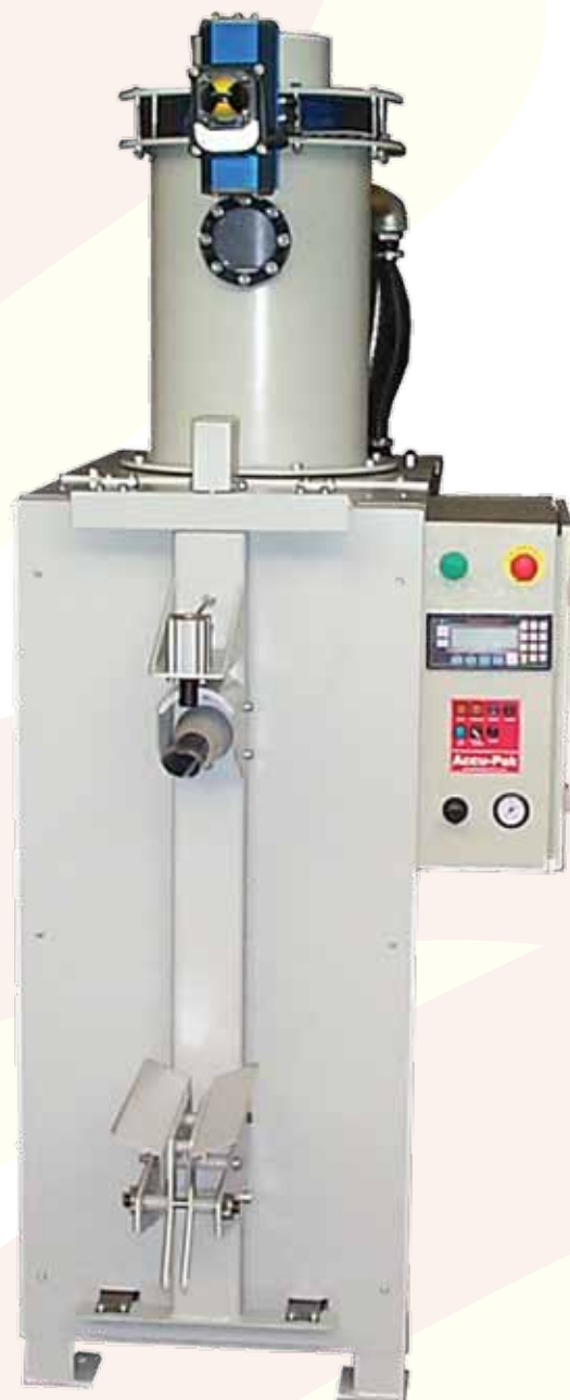
VA2550 VALVE BAG FILLER