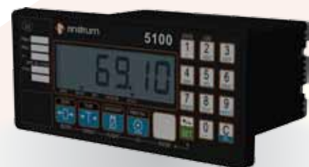
RINSTRUM 5100 DIGITAL BATCHING INDICATOR