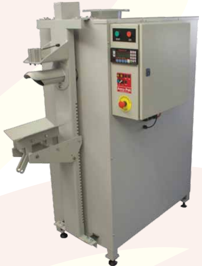
VA25 AUGER FILLER