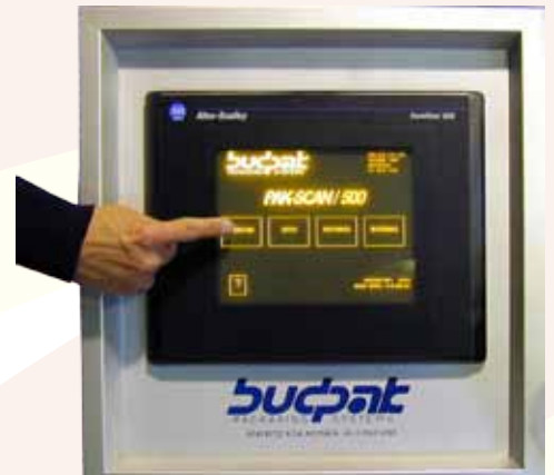
PAK-SCAN/500 WEIGHING CONTROLLER