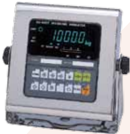
CHOICE OF INDICATORS