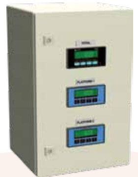
SAMPLE DISPLAY ENCLOSURE

AVAILABLE AS TRADE APPROVED OR NON-TRADE