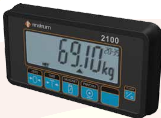
RINSTRUM 2100EX INTRINSICALLY-SAFE OFF-THE-SHELF DIGITAL INDICATOR

The Digital Indicator may be an off-the-shelf intrinsically-safe indicator, or an existing digital indicator modified to be explosion-proof.